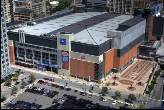
Seating Chart View

b) Many musicians have dreams about playing certain venues what Venue stands out to you as one that you have never played but would like to play in your career?