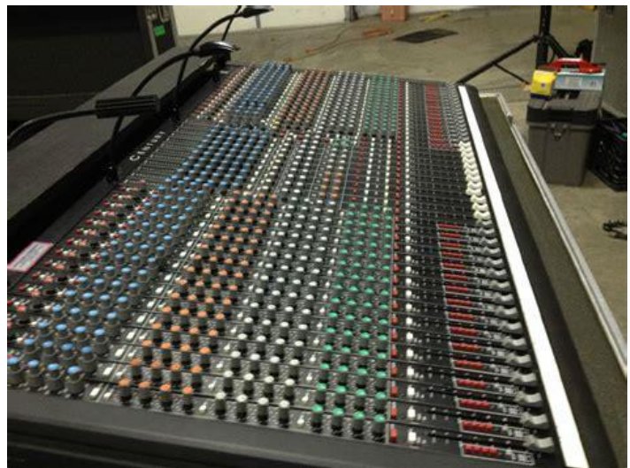
Figure 1 Yamaha Monitor Board

b) Stage sound seems to be very important for musicians to be able to hear themselves it is known in the trade of many to have a good mix on stage so that everyone is comfortable, (if you are a singing drummer please mention) so what do you really need to hear in your monitor when doing stage monitor check?