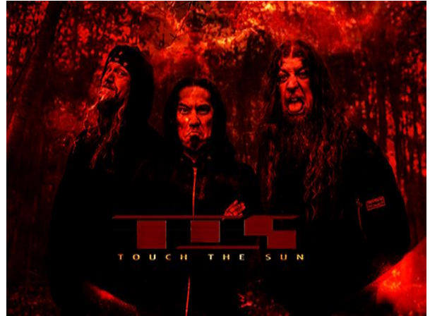
Touch The Sun

My requirements are pretty basic. I like kick/guitar/ and vocals in my monitors. Everything else i can get off the stage and whatever the other guys have in theirs. If I'm running in ears i like a bit more of everything due to the isolation. But I'm mostly stuffing plugs in my ears and cranking the monitors lol