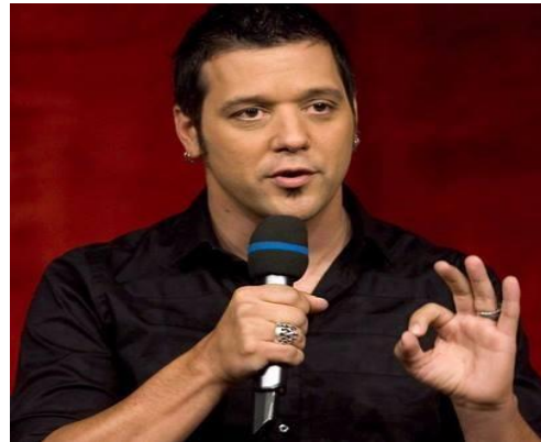
George Stroumboulopoulos CBC Tonight Show

As a journalist and radio show host I to interview a wide range of artists due to the fact more programs than a country based radio program so I get to have a wide range of guests from actors to artists, from song writers to sports celebrities in saying that there are certain guests that I would like to interview like Melissa Etheridge and a journalist known as George Stroumboulopoulos.