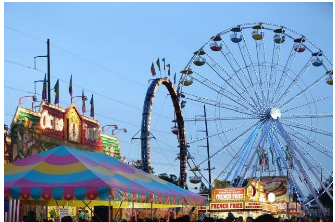
North State Florida Fair

I will take any opportunity as I can get as an artist. We have played several places outside of SC. TN, NE, Ok, GA, Just recently we played The North State Florida Fair . My main goal as an artist now is to get on tour as an opening act for some major artists to help build my fan base. But I know I have made it when I make my debut on the Grand Ole Opry stage. That's definitely one of my goals.