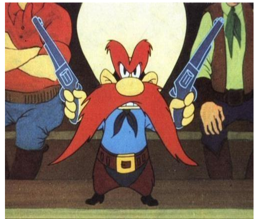
A Rowdy Shouting Cowboy

3) With the term Cowboy most people would think of a cowboy on the prairie rounding up a heard of cattle back in the days now it seems as though Cowboys have become more Urban and this is apparent in your video called Rowdy Shouting Cowboy, so when I look at your video called Rowdy Shouting Cowboy what would the Rowdy Shouting Cowboy be shouting if they were in that video? And express your reasoning for your answer?