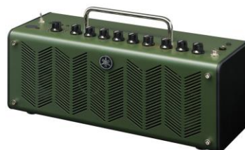
Yamaha THR 10x