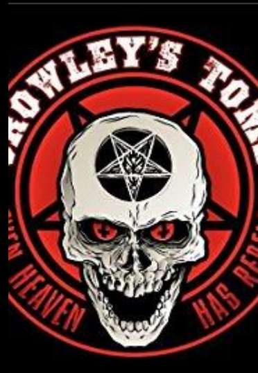
Crowley's Tomb The Movie

I am working on music for a horror movie called Crowley's tomb and a couple of solo projects one is musical cd with all proceeds to be donated to fight against cancer with collaborating artist and another for personal, but I am taking my time on those except the horror movie due to personal problems due to health!