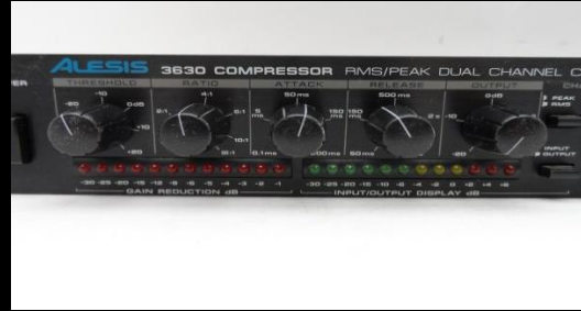
Alesis Rack Mount Compressor