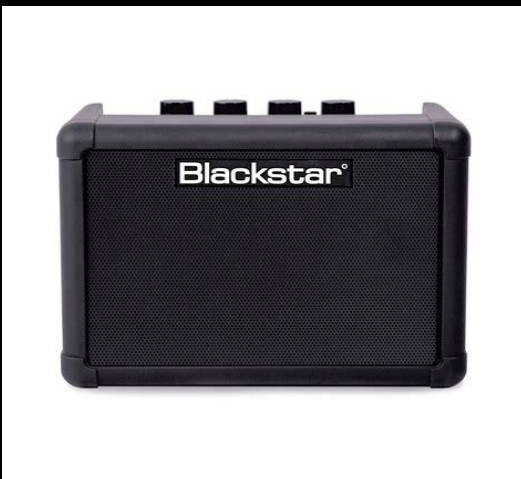
BlackStar Blue Tooth

https://usa.yamaha.com/products/musical_instruments/guitars_basses/amps_accessories/t_hrh/index.html