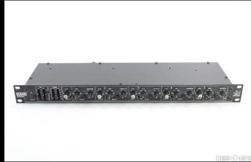
Rane Parametric Rack Mount Equalizer