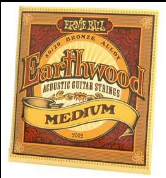
Ernie Ball Acoustic Guitar Strings

d) Picks, Strings and electronic pickups are used for live performances and recordings now a day from the aspect of a guitar player some also finger pic and use their thumb in the way that they play, These factors that I have mentioned I would like for your opinions upon these topics?