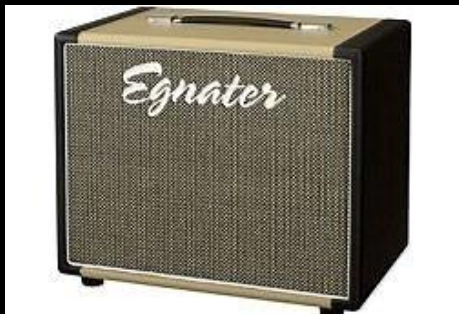
Egnater REBEL 112X 1 x 12 inch Closed Back Guitar Amplifier Extension Cabinet

h) As to your gear I would like to have the audience know about the type of amplifiers you are using and how important is it for your stage crew to know about your amplifiers? (tone controls etc)