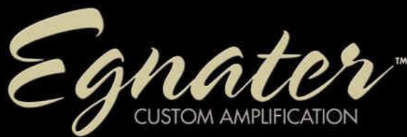
Egnater Custom Amplication

there they may not have the economics to afford a name brand while they are building their careers in the music industry.