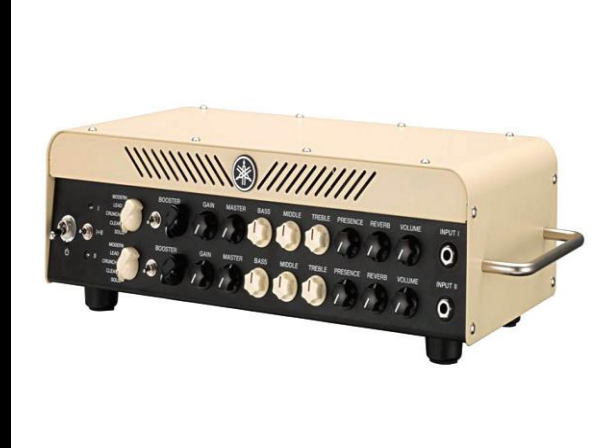
Yamaha THR100 HD

k) When I bought my equipment I bought my amplifiers from Bay Avenue Music in Trail British Columbia Canada and it is interesting that they informed me about the Yamaha THR100 HD and I have been doing more study into these particular amplifiers and have found out that with proper equipment they can either be used for live or recording purposes and you know to play with some hard hitting drummers from the hard rock and metal music industry what it would take to get up to that type of decibel level. Could you make comments as to my statement? (Cabinets etc.)