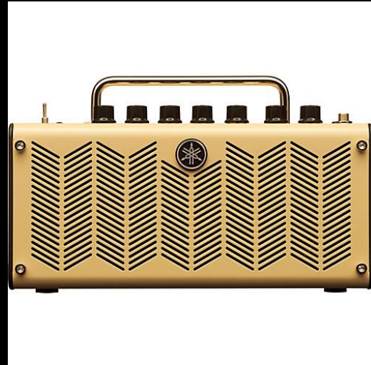
Yamaha THR Amp Series

The above amps that I have several features that I am getting used to as any learning curve you reach certain crossroads like Steve Vai did in that movie. A never ending learning cycle.