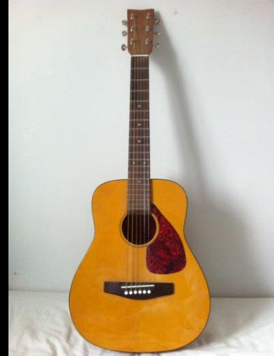
Yamaha FG Junior

Yamaha makes dam good stuff, I used to have one and it played just fine it all depends on what the a person wants and needs, there is a lot of company's unknown that are producing acoustics and play and sound great at a lot less cost to the consumer so look out for these company's and brands but also learn about woods and the tones they produce that is a very important thing that some over look and tone woods is and always will be that main thing to look for in acoustics!