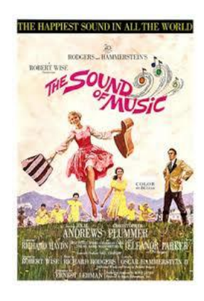
B) what other film that you have seen stands out that was based around a soundtrack such as The