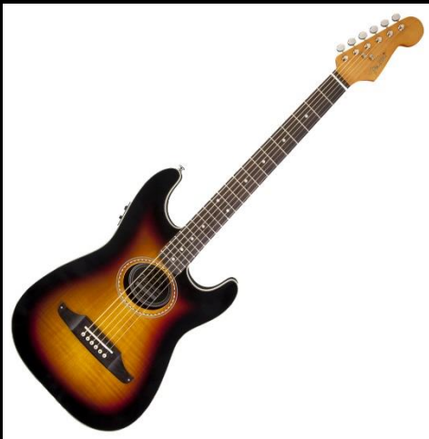
Fender "Stratacoustic" Video