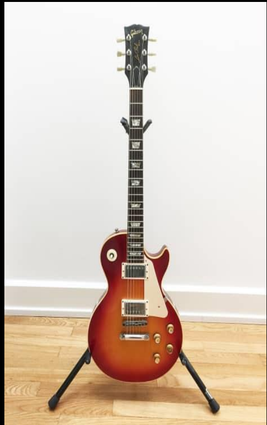
Gibson.com: Gibson Les Paul "Deluxe 75"

7) There are other miscellaneous items that a guitar player uses such as picks, strings, cables etc. could you tell the reading audience about this items that you are currently using and give details as to why you use those particular items?