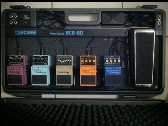
Boss Pedal board with Wawa Pedal