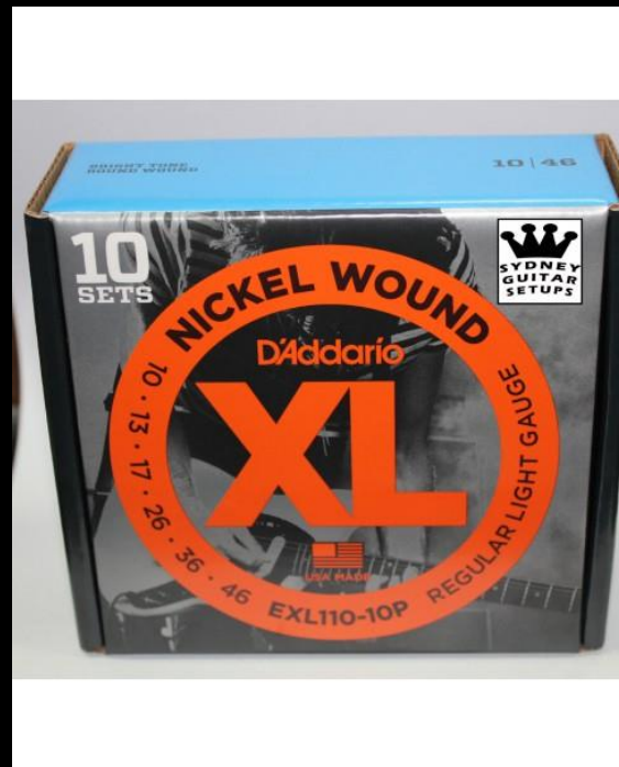
D'addario "10 to 46"

electric, any thing across the board has always been Dunlop .46 mm. I buy them in bulk, they are everywhere in my house, in my car, in my pockets, in my kayak, in my dryer, in my washer, picks, picks, picks, ha. I have also always been a D'addario "10 to 46" guy on electric, love them, a very strong string with long life and very rarely will break, and sound great. Cables are not a big deal for me as long as they are reliable, I do like "Road Hog" cables, and as the world gets more and more wireless it is less of a concern on stage as time goes on.