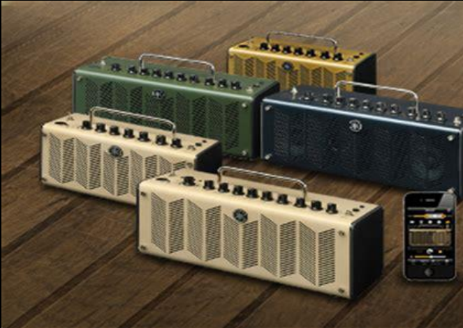
Yamaha THR Series Amplifiers

a lot of that for me went away as I found my own unique flavor, yet an effects pedal is almost always beneficial during a live show. A lot of us guitar players are just a little bit secretive about certain sounds we get, because it is "ours", and it can be a long process to get there. I will say I am never disappointed with Rolland and/or Boss guitar effects pedals. Like all gear it is a very personal thing trying to get a stand out sound of our own.