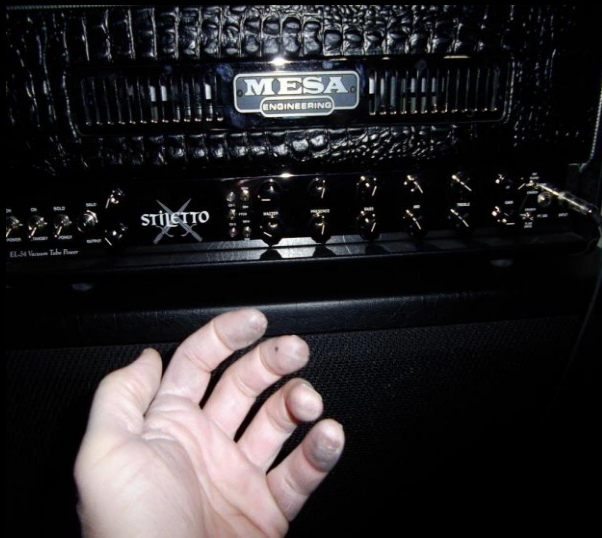
Mesa Boogie "Stiletto"