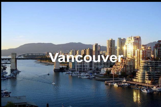
Vancouver British Columbia Canada

I moved from Chicago to LA in late 70's and got signed to Capitol Records and played full time until 1990. Soon after I hung up my instruments I started developing and managing the careers of other up and coming musicians.