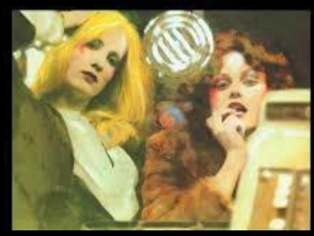
Two For The Show CD Buy It Now