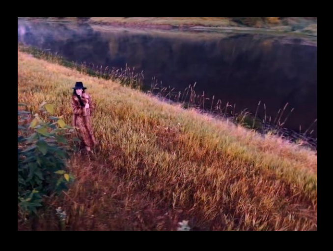
Mountain Child Official Video on Youtube

Mountain Child was one of those songs that was stuck in my head before it ever became a song, if that makes sense. Since moving back to BC last year after being in Fort McMurray for 10 years, I have been living in Barrowtown - a gorgeous little BC gem tucked into the Chilliwack mountainside. I was loving life getting back to my roots, surrounded by animals and the river. Every morning I woke up to the sun on that mountain, went to bed with the stars behind it. Mountain Child came from just that. Wefilmed the video with that view as a backdrop, a few feet from my house. BC has a ton of hidden gems, its hard not to find your voice here.